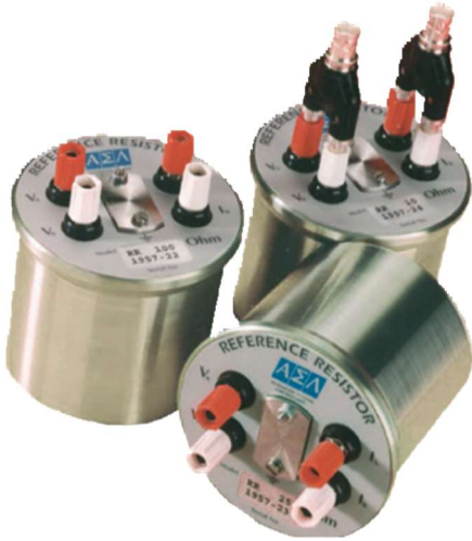
Model 5695 reference resistor with different resistance range