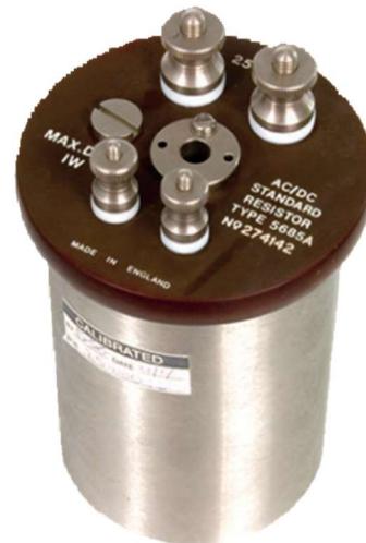
Standard reference resistor, model 5685, with 10 \Omega