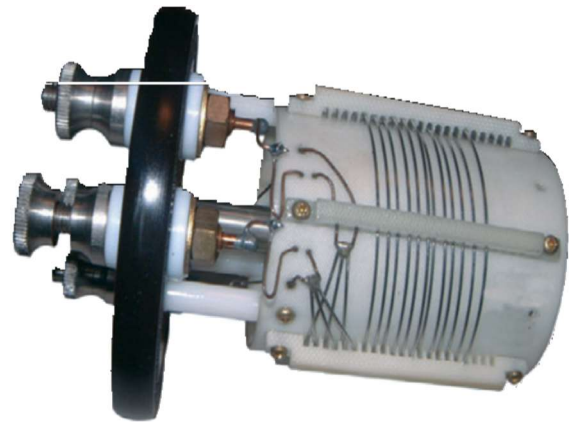
Standard reference resistor, model 5685

Since the introduction of these standard reference resistors they have been adopted by many major industrial companies as their primary resistance reference standards. Information obtained from laboratories over the past twenty-five years indicate their exceptional high specification. With monitored examples exhibiting stabilities within 1 ppm over a period of ten years.