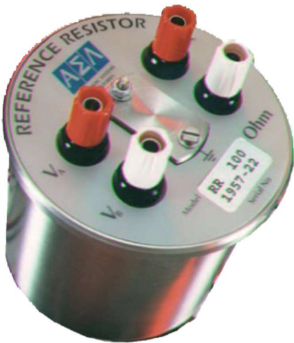
Model 5695 reference resistor with 100 \Omega