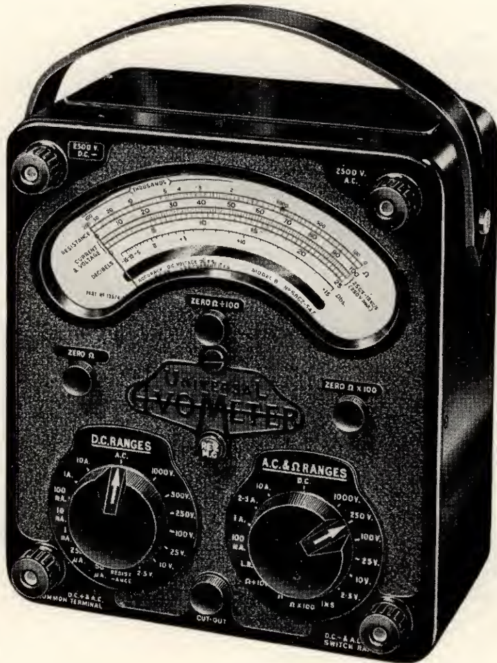
THE MODEL 8 AVOMETER MK. II