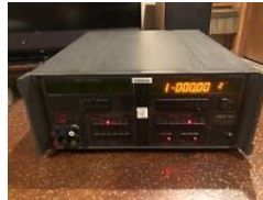
Datron 4200a AC Standard Voltage/Curre... $1,499.00 + shipping