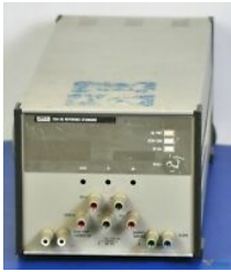
Fluke 732A DC Voltage Reference Standard (10V... $1,199.00 Free shipping