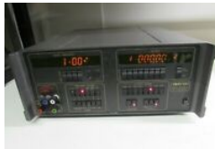
Datron 4200 AC Standard Voltage/Current... $1,595.00 + shipping