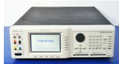
Fluke Wavetek Datron 9100 Multifunction... $11,499.00 Free shipping