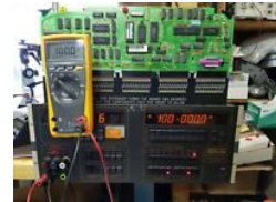
Datron Wavetek 4000 4000A 4200 4700 4705... $566.25 + shipping