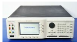
Fluke Wavetek Datron 9100 Multifunction... $11,499.00 Free shipping