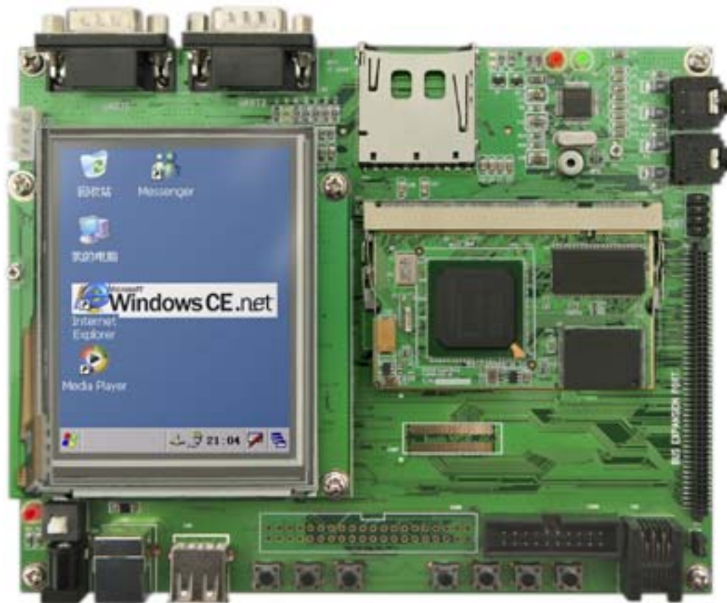
Embest XScale PXA270 Evaluation Board