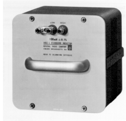
Figure 1: 1482 Inductance Standard