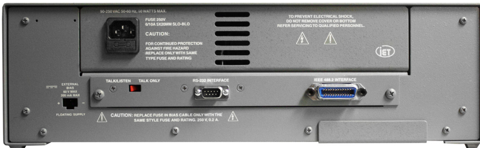
Rear view of 1689 RLC Digibridge with optional IEEE-488 interface

The automated capabilities of this meter can be further extended with the addition of an optional IEEE-488 interface (shown on the left), which allows for remote operation, programming, and data acquisition.