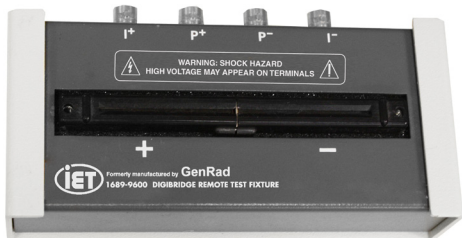
Remote Test Fixture (A radio-axial connection for 1689M) 1689-9600