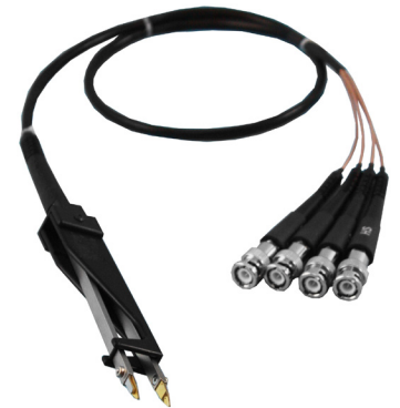
Chip Component Tweezers 7000-05