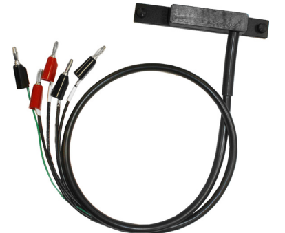
1657-9600 Banana-Plug Extender Cable