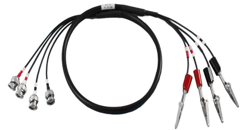
Alligator Clip Leads, 1 Meter (May also be used as bnc-to-banana-plug connector) 7000-04