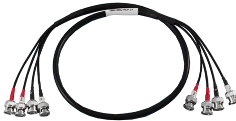
bnc-bnc Extender Cable, 2-Meter 1689-9602-2