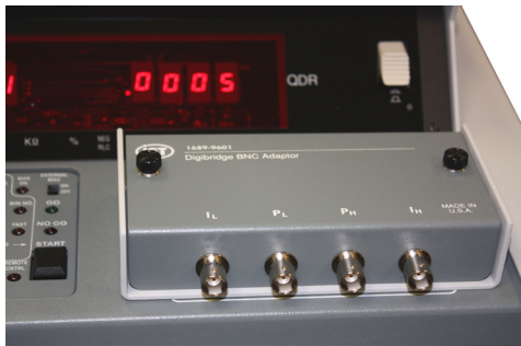
Digibridge BNC Adaptor (A bnc interface for 1689) 1689-9601