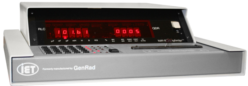
1689 RLC Digibridge