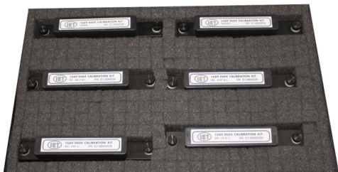
Digibridge Calibration Kit 1689-9604