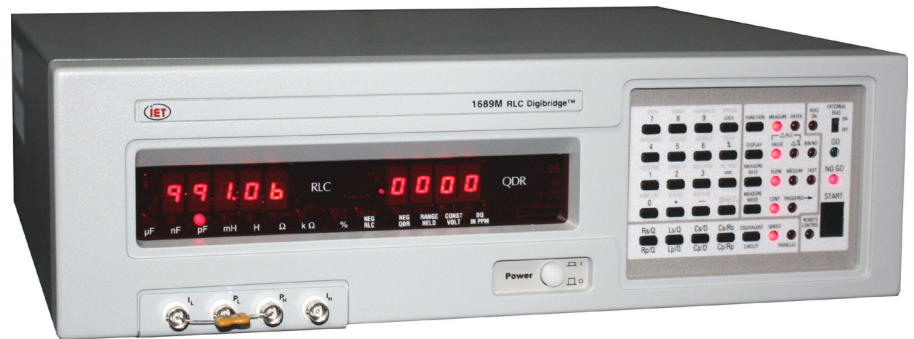
1689M RLC Digibridge

The GenRad 1689 Precision Impedance Meter gives you the best performance for your most demanding applications, whether they be production testing, incoming inspections, component design and evaluation, process monitoring or dielectric measurements. It is a versatile, full-function, microprocessor-based passive component tester.