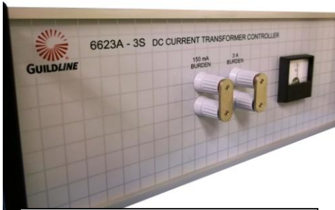
6623A-3S Front and Rear Views

The direct current transformer is designed with an open window to pass through a cable, set of cables, or buss bar that carry the current to be measured. The 6624CT-3000 DC Current Transformer produces an output current that varies directly with the input current in three ranges. By the connection of a reference shunt burden on one of the output terminals the current can also be calculated by measuring the voltage drop across the reference shunt. Note however that the direct current reading using the output current typically has much less uncertainty than using a reference shunt burden. All necessary interconnections for the control of a Guildline 6623A current source, the 6623A-3S Current Transformer Controller and the 6624CT-3000 Current Transformer unit are provided such that no hardware reconfiguration is required over the full range of operation other than the connection of the output current terminal to an appropriate reference burden.