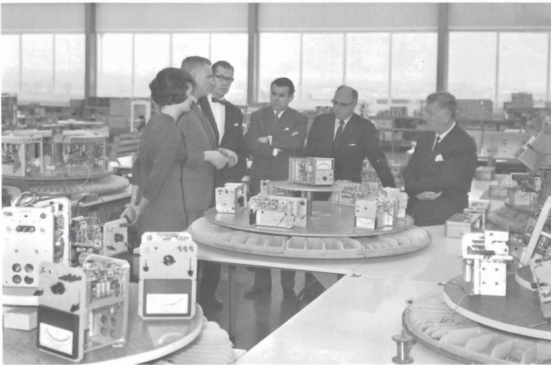
A group of HP's European personnel who attended the dedication ceremony are seen in a production area midway through the tour.