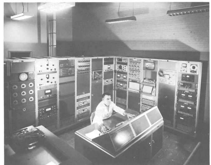
Several HP instruments have been integrated into the bioinstrumentation control center, including an 8-channel Sanborn recorder.