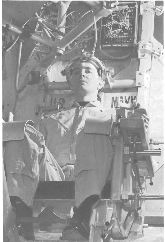
Strapped in position with electrodes in place, a pilot is ready for a spin at varying angles.

With such a lineup of instruments in use at Pensacola, HP can truly claim to have made a contribution to a science oriented toward the study of disorientation.