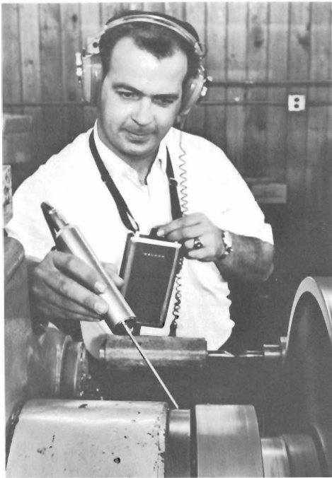
Light, simple-to-operate Delcon detectors can be used to locate parts wear in machinery.

The new division has 30 employees in Palo Alto, expects over $1 million in sales this year.