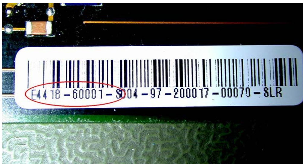
Figure 1. Label Example