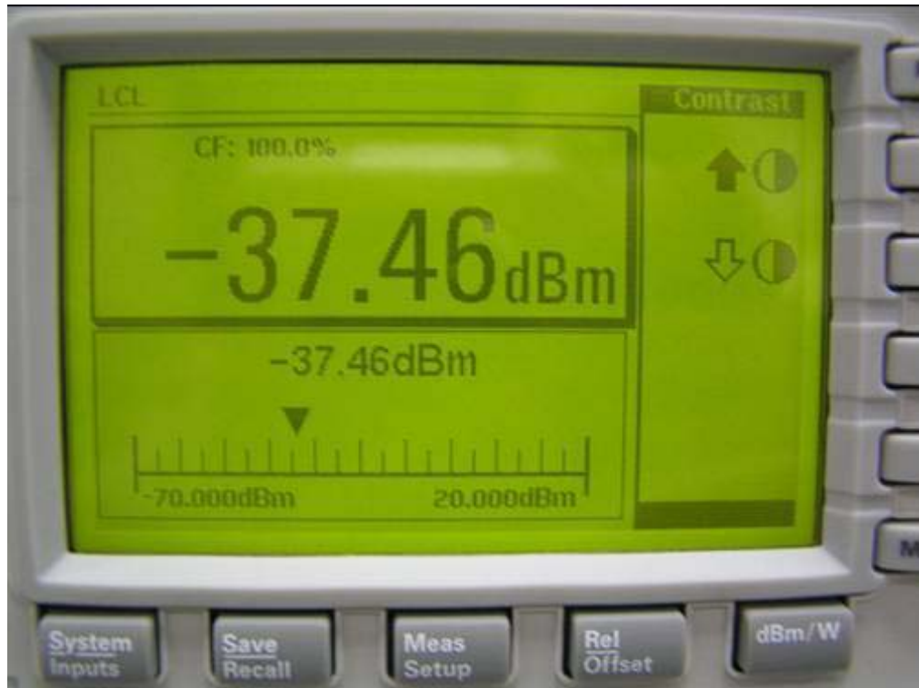
Figure 2: Good measurement board with sensor detected

Replace the problematic measurement board with a good measurement board. After replacing the measurement board, repeat the steps mentioned above to verify that the problem is resolved. It should indicate that sensor is connected even after hot plugging.