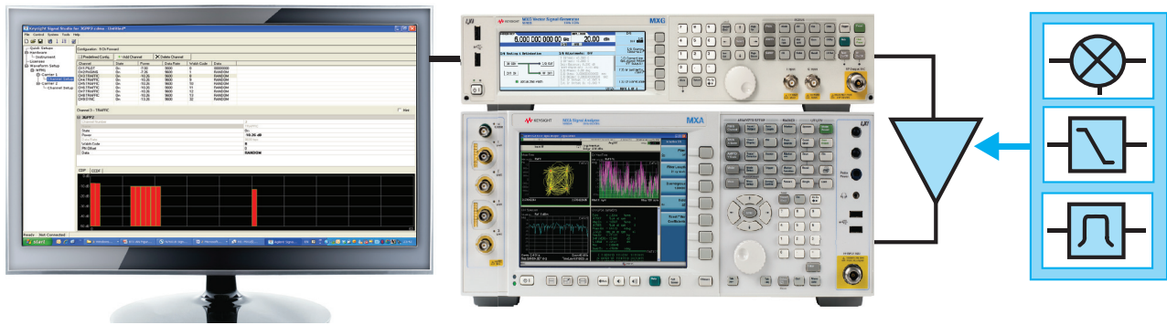
Figure 1. Typical component test configuration using Signal Studio's basic capabilities with a Keysight X-Series signal generator and an X-Series signal analyzer

The N7601B Signal Studio for cdma2000/1xEV-DO software's basic capabilities enable you to create waveforms with multiple and mixed carriers for component testing. With the purchase of the N7601B software's Basic CDMA license, the software generates waveforms in both the IS-95A and the cdma2000 radio formats. With the purchase of the N7601B software's Basic 1xEV-DO license, the software generates waveforms in both the 1xEV-DO Rev. 0 and 1xEV-DO Rev. A radio formats. Both Basic licenses allow the software to generate waveforms in all four radio formats.