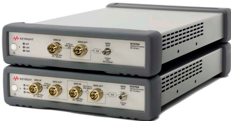
Figure 2: For optical test, two coupler/converter solutions are available to pair with the N4877A