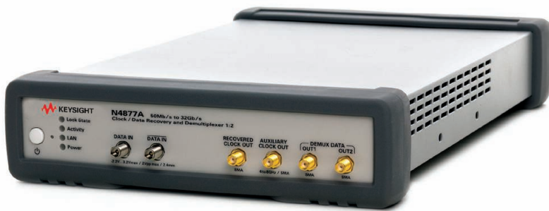
Figure 1: The N4877A accepts single ended or differential electrical inputs to 32 Gb/s