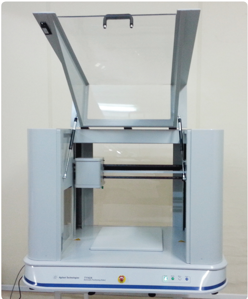
T1142A Automatic Positioning Robot