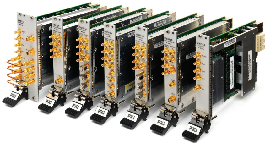
Figure 2. M9391A PXIe vector signal analyzer and M9381A PXIe vector signal generator modules.

Test systems must meet today's functional demands for 802.11ac, while maintaining backward compatibility to support 802.11n, and be flexible enough to support bandwidths up to 160 MHz.