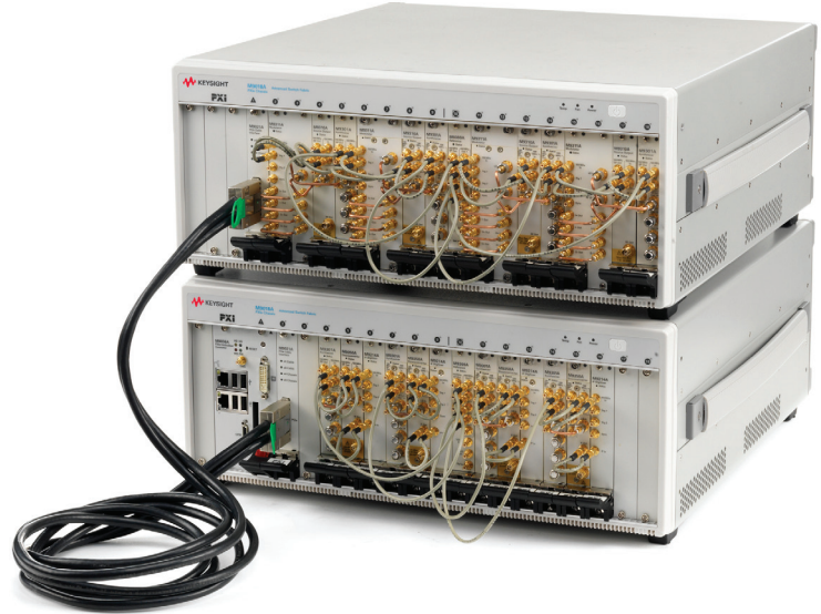
Figure 3. Measurement setup for 4x4 802.11ac MIMO transmitter and receiver testing.

A 4-channel VSA and 4-channel VSG (4x4) 802.11ac MIMO measurement setup is shown in Figure 3. The setup includes two M9018A PXIe 18-slot chassis and two internal M9036A embedded controllers. Four M9381A PXIe VSGs are housed in one chassis and four M9391A PXIe VSAs in the other. Each chassis also includes a single M9300A reference to drive the 10 MHz reference on the backplane of the PXI chassis and synchronize the timing of multiple modules.