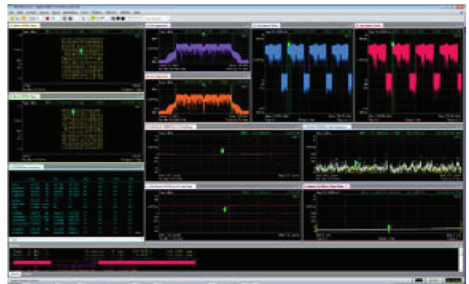
Figure 4. Keysight 89600 VSA software illustrating a 2-channel configuration with two streams at 80 MHz bandwidth.

For testing receivers, Keysight's M9381A VSG with Signal Studio software provides full support of 802.11ac standards-based signals. Signal Studio software is used to generate 802.11ac standard compliant waveforms including MIMO/MU-MIMO, MAC layer, ARB-based channel fading models, multi-frame and sequencer playback for PER/sensitivity tests. The M9381A VSG provides frequency coverage up to 6 GHz, support for 256 QAM, and RF modulation bandwidth up to 160 MHz with \pm 0.5 dB flatness. Keysight's 802.11ac MIMO test solution provides the accuracy, speed, flexibility and scalability required during research and development and design verification test of 802.11ac MIMO transmitters and receivers.