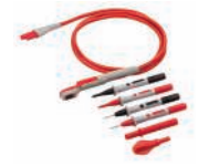
U5403A Remote switch probe