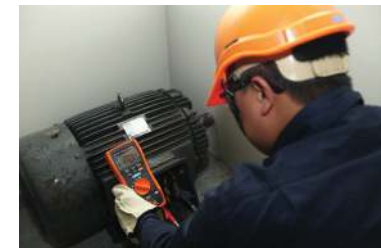
Troubleshooting electrical motor accurately using the insulation resistance tester