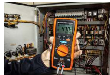
Testing insulation resistance cables when commissioning electrical installations