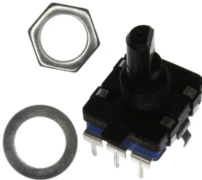
Image shown is a representation only. Exact specifications should be obtained from the product data sheet.