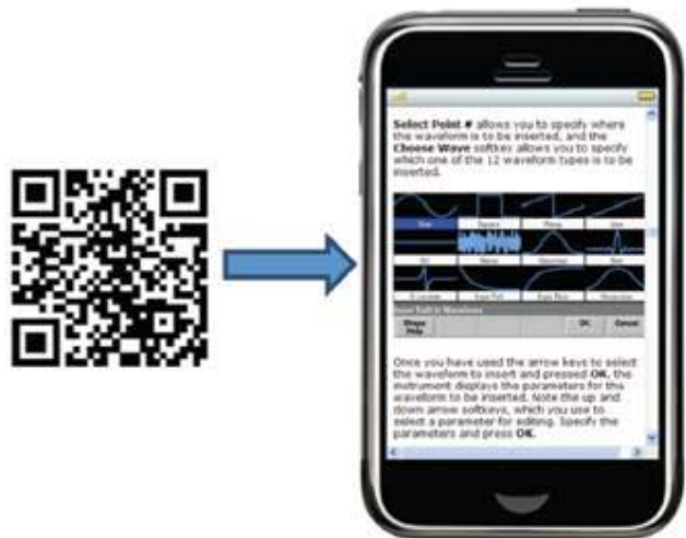
Figure 1. Scan the QR code to pull up 33500B documentation on your mobile device.

To meet these needs, Agilent now offers a fully integrated set of user, service, and SCPI programming documentation for the Agilent 33500 Series waveform generators. The document uses a streamlined writing style that makes extensive use of graphical images, and it is available in English, French, German, Japanese, Korean, Russian, and Simplified Chinese on a CD that is included with your instrument. You can also download the latest documentation from the Agilent Web site by pressing View Products at www.agilent.com/find/33500 . A version of the documentation optimized for viewing on mobile devices is available at www.agilent.com/find/33500doc . You can also use a QR code app and the camera on your smart phone or tablet to scan the QR code in Figure 1.