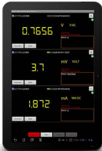
Figure 5. Up to three multimeter measurements with the Keysight Mobile Meter

Keysight Mobile Meter is a free Android application software that allows an Android device to connect, control and perform up to 3 multimeter measurements. Without the need to be physically present at various points, users can now extend their reach to two or three places. This solution allows you to make measurements from a safe distance, eliminates the need to walk back-and-forth between measure target and control points, and monitors multiple measurements simultaneously. Achieve higher work productivity when you use the U1177A with your Keysight handheld digital multimeters.