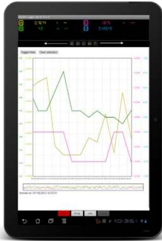
Figure 4. Data logging with Keysight Mobile Logger software.

Data logging is an important function for industrial users to capture data streams or plotting trending graphs. These data and graphs are used for analysis to identify intermittent behavior or detect drifts. Keysight Mobile Logger is the free Android application software that logs data and provides trending graphs from Keysight handheld digital multimeters. Keysight Mobile Logger offers an array of extended functions such as sending e-mail or Short Message Service (SMS) automatically, and pan and zoom function via the Android device's touch screen. Alternatively, data logging and monitoring activities can also be performed at the comfort of one's Personal Computer (PC) via a downloadable Keysight GUI data logger software.