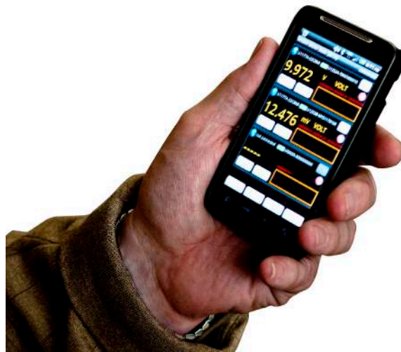
Figure 6. Make measurements with the Keysight Mobile Meter via an Android smart phone

Keysight Mobile Meter is a free Android application software that allows an Android device to connect, control and perform up to 3 multimeter measurements. Without the need to be physically present at various points, users can now extend their reach to two or three places. This solution allows you to make measurements from a safe distance, eliminates the need to walk back-and-forth between measure target and control points, and monitors multiple measurements simultaneously. Achieve higher work productivity when you use the U1177A with your Keysight handheld digital multimeters.