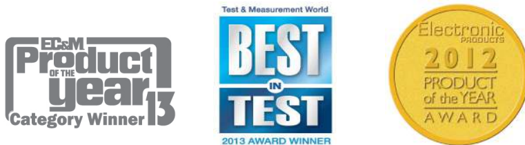
Figure 1. Award winning U1177A Infrared (IR)-to- Bluetooth adapter is being recognized as an innovative solution in Test & Measurement industry

Keysight Technologies, Inc. U1177A Infrared (IR)-to- Bluetooth adapter offers wireless remote connectivity solution via Bluetooth connection simply by attaching the adapter to the IR port of a Keysight handheld digital multimeter. The wireless remote connectivity is set up when a Keysight handheld digital multimeter is connected to U1177A and an Android device (tablet or smart phone) with the installed software. Every U1177A also has a unique Media Access Control (MAC) address. User can quickly and easily scan for the right U1177A using their Android device and pair up with the U1177A.