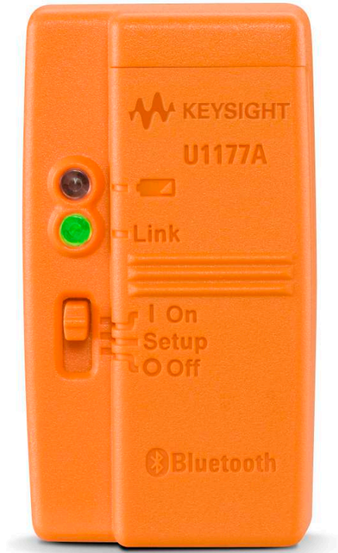
Figure 3. The U1177A as illustrated