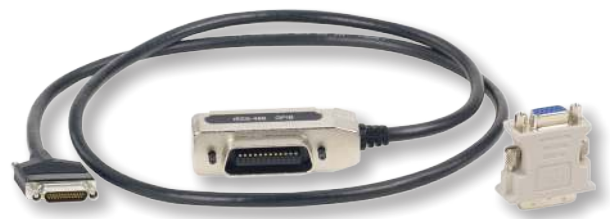
Figure 2. Accessories included with the M9036A