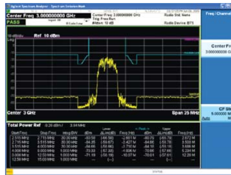
PowerSuite (spectrum emission mask)