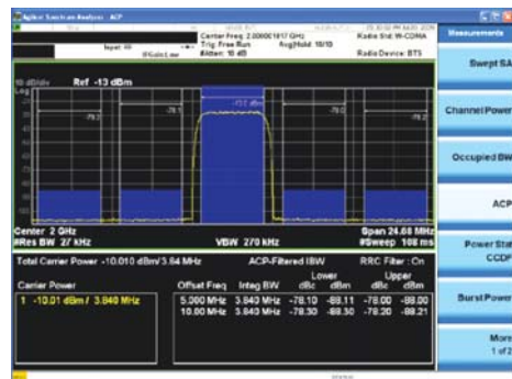
PowerSuite (adjacent channel power)

Technical data, availability, and pricing subject to change without notice. © Agilent Technologies, Inc. 2013, Printed in USA, May 29, 2013 5990-6912EN