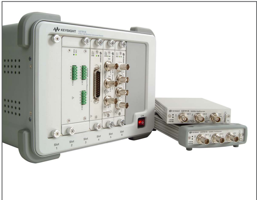
Figure 1. The dual-play capability allows the U2701A/U2702A USB modular oscilloscope to be used as a standalone unit or as part of test system in a cardcage.

The U2701A/U2702A USB modular oscilloscopes are equipped with High-Speed USB 2.0 interface for easy setup and plug-and-play. This ease of use makes the oscilloscopes ideal for the education, design validation and manufacturing industries.