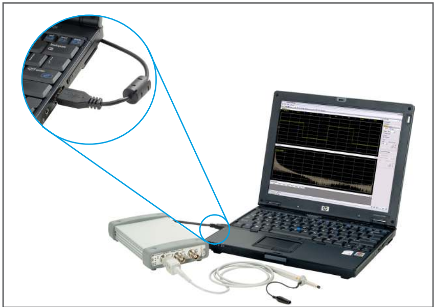
Figure 2. The U2701A and U2702A connect to the computer or laptop with a USB cable, enabling fast data transfer.

The U2701A and U2702A USB modular oscilloscopes offer analysis functions such as addition, subtraction, multiplication, division, and Fast Fourier Transform (FFT). FFT allows you to manipulate the waveform using five types of windows such as Hanning, Hamming, Blackman-Harris, Flattop, and Rectangular.