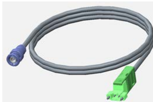
Figure 1: 8020-SHI-BNC-2 cable assembly

The Keithley Instruments Model 8020-SHI-BNC-2 is a 2 meter, 2-pin Phoenix to BNC Cable. This cable assembly is used to connect the Sense HI of the Combined 2651 channel of the Model 8020 to a BNC connector.