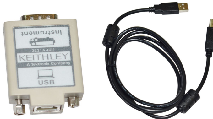
Figure 1: Model 2231A-001 USB Adapter

To set up the remote communication through the Model 2231A-001, configure the computer as follows: