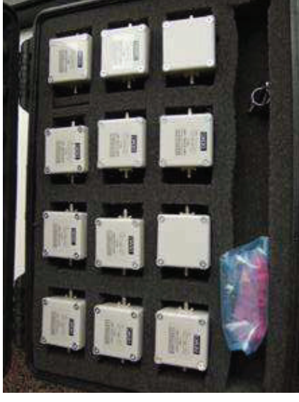
Contents of 4200-Q-STBL-KIT