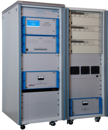
Calibration of voltage output DCCTs