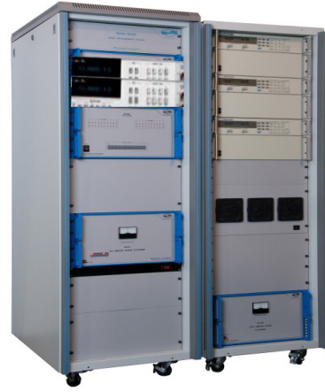
Calibration of both voltage and current output DCCTs