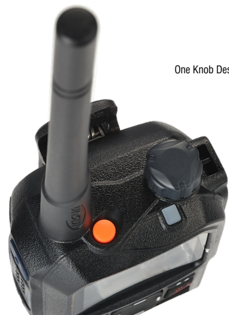
One Knob Design

The advanced features can be upgraded to your existing DP770 radios by software without purchasing a new one.