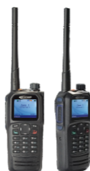
DP770 DMR PORTABLE RADIO

For more information, please visit www.kirisun.com or contact marketing.os@szkirisun.com