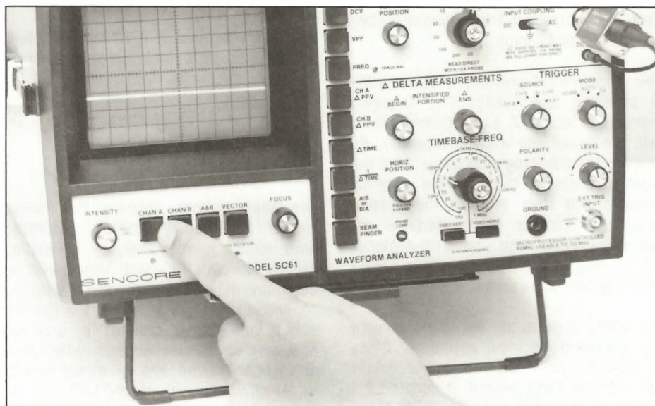
Fig. 3: Press the channel A and B CRT selector at the same time to add the two traces together. Be sure both buttons stay latched.