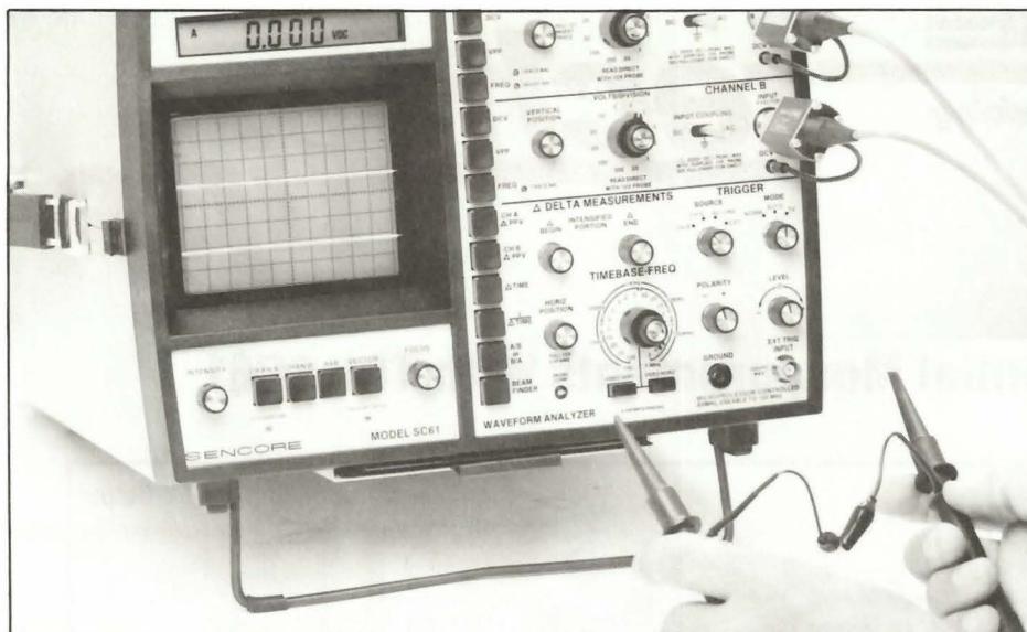
Fig. 2: Connect the two probe grounds together before connecting the SC61 probes to the circuit. Be certain that the grounds don't connect to the circuit.