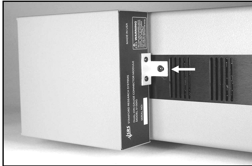
Figure L-4. O100IG box must be fastened to the side of the IGC100 controller.

Fasten the O100IG box to the side of the IGC100 controller using the Phillips screw included in the kit, as shown in Figure L-4.