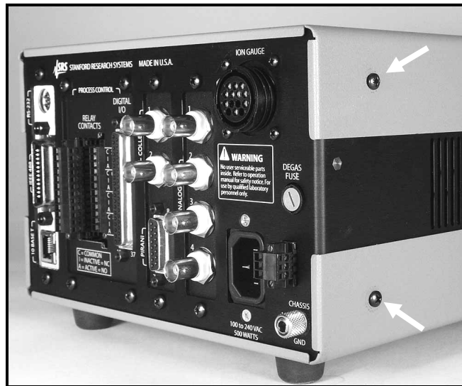
Figure L-2. Remove of the top and bottom cover screws from the back end of the left side of the IGC100.