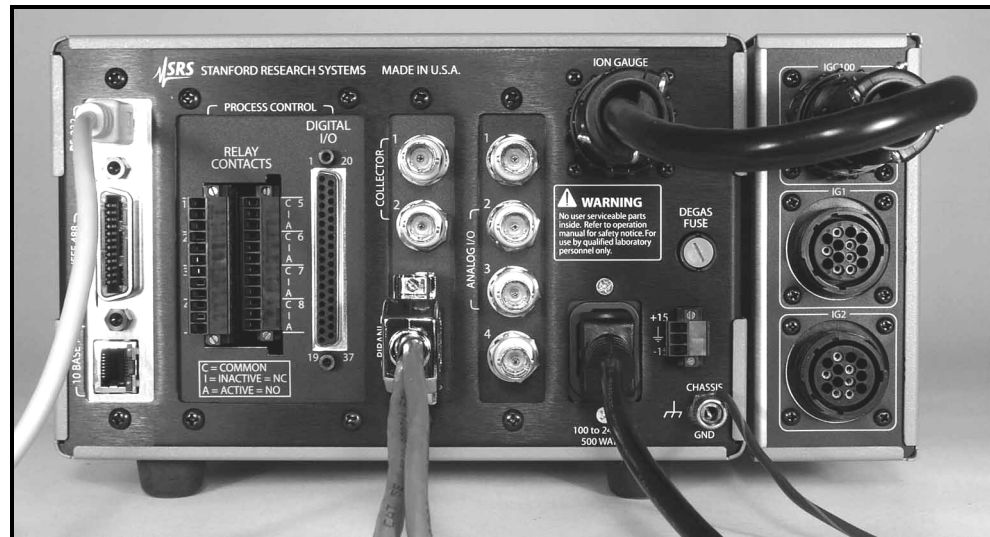
Figure L-1. Side Mounting configuration.

For the most compact design and safest operation, SRS recommends you mount the O100IG box on the left side of the IGC100 controller as shown below in Fig. L-1. However, side mounting is not a requisite for the proper operation of the O100IG option (i.e. steps 1 –4 of the following installation procedure are optional).