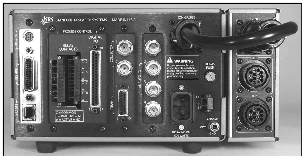
Figure L-5. Connect the IGC100 Ionization Gauge port to the O100IG Box.

Electrically connect the O100IG box to the IGC100 using the Connection Cable included in the kit. The male cable connector end attaches to the ION GAUGE port on the back of the IGC100, while the female cable connector end attaches to the IGC100 port on the O100IG Box. Figure L-5 shows a completed connection.