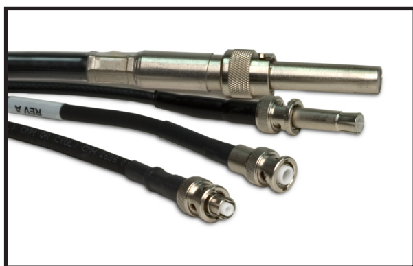
High voltage cables

Operation is simple. The parameter being adjusted or set is displayed separately and can be entered without affecting the actual output voltage. Up to nine instrument configurations can be stored and recalled at any time, making it easy to run multiple tests.