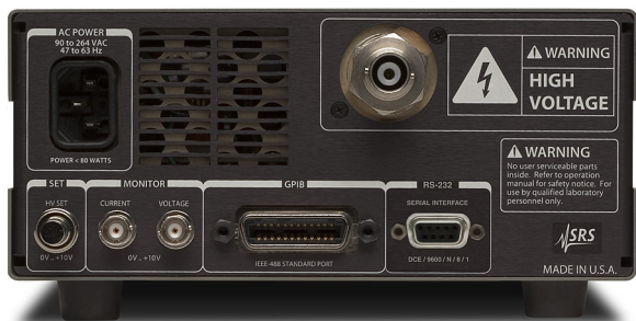
PS370 rear panel

Both GPIB and RS-232 computer interfaces are standard on all 10 W supplies. GPIB is available as an option on the 25 W instruments. All parameters can be set and read via the computer interfaces.