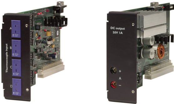
PTC330 Thermocouple Card PTC430 DC Output Card

isothermal block, with its own RTD temperature sensor, provides highly accurate cold junction measurements.