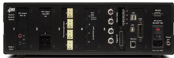
PTC10 rear panel

Macros are a powerful tool that can be used to tailor the behavior of the PTC10 for your experiment. For example, infinite-loop macros running as background tasks can take steps to address alarm conditions, automatically switch between sensor inputs (or heater outputs) depending on the current temperature or other factors, or implement cascade feedback schemes.