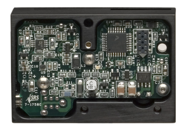
SR475 Shutter Head with cover removed, revealing control system electronics

The 3 mm clear aperture (SR475) is designed for easy alignment and is large enough to be used with common light sources. Typical rise and fall times are under 500 \mu s, and repetition rates from DC to 100 Hz can be used. Unlike other shutters, the SRS shutter is not duty cycle limited — you can run any duty cycle you choose. The SR476 has a 1 mm clear aperture and supports repetition rates to 125 Hz.