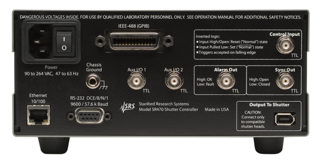
SR470 rear panel

A variety of trigger modes are provided — internal, external, front panel, and continuous — giving you the flexibility to handle just about any application. Triggered bursts from milliseconds to months can also be generated, placing the SR470 in a class of its own.