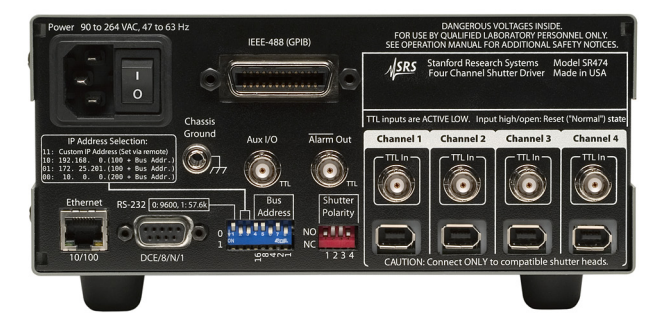
SR474 rear panel

The SR470 and SR470 Laser Shutter systems from SRS offer performance and reliability not found in other systems. For more details call us at 408-744-9040.