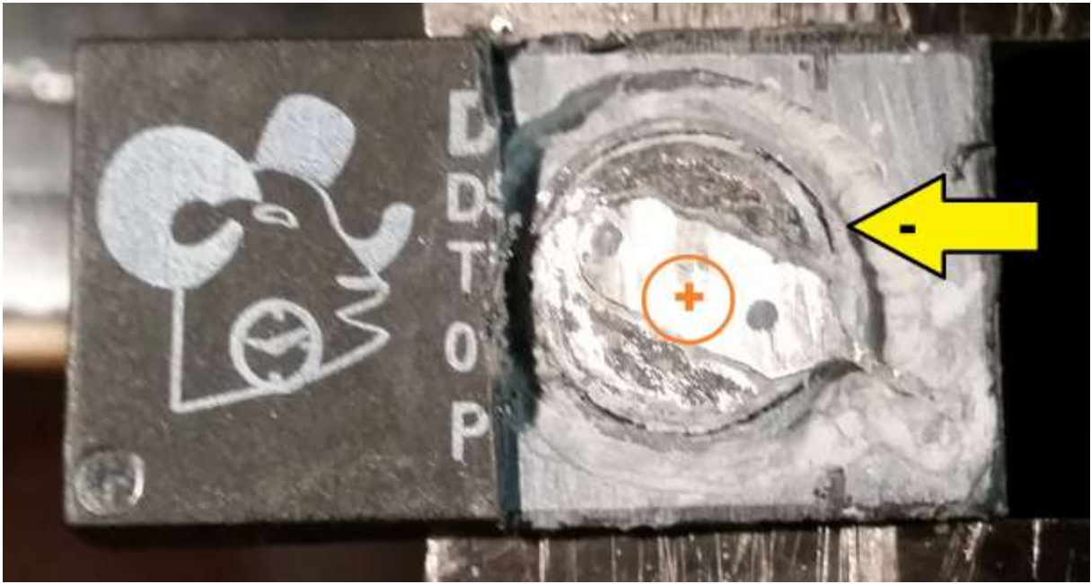
After removing the old battery: