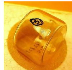
Rb High Precision Low Phase Noise Rubidium Tu... C $63.56 Free shipping Popular