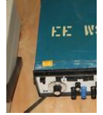
Exact 119 Func Generator C $31.80 + shipping