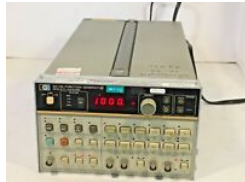
HP - Agilent - Keysight 3314A Programmable Mult... C $254.39 + shipping