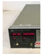
HP AGILENT 3437A SYSTEM VOLT... C $95.40 + shipping