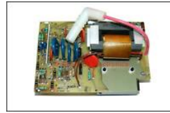
Tektronix 670-1855-01 High Voltage Board Assy For... C $108.12 + C $57.24 shipping