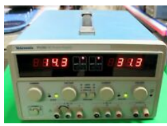
TEKTRONIX PS280 DC 0-30V TRIPLE POWER... C $146.27 + shipping