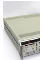
Hewlett Packard Waveform Recr... C $393.40 + shipping