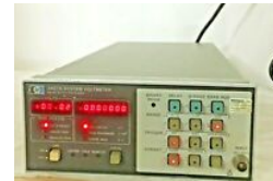
HP AGILENT 3437A SYSTEM VOLTMETER... C $139.91 + shipping