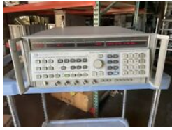
HP HEWLETT-PACKARD 8341B SYNTHESIZED... C $890.37 + shipping