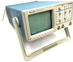
Tektronix TDS 320 Two Channel Digital Oscillosco... C $254.38 + shipping