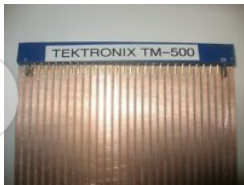
Tektronix TM500, TM501, to TM506, RTM506, TM5003... C $76.32 + C $26.39 shipping