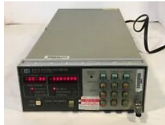
HP AGILENT 3437A SYSTEM VOLTMETER... C $95.40 + shipping