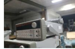
Agilent 33120A 15 MHz Function / Arbitrary... C $317.97 + shipping