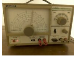
LEADER LSG-17 Signal Generator Super rare nice... C $189.52 + shipping