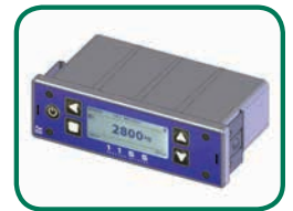
DIN Radio Mount