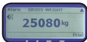
Gross Vehicle Weight