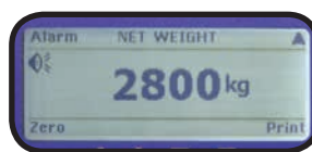
Net Payload Weight