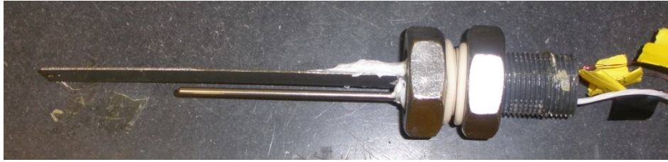
Figure 2: Cantilever beam with strain gage attached

“With the quality products from Micro-Measurements, we were able to create a device that can continually monitor the specific gravity of a fluid. The device has proven to be a reliable and accurate tool in the hands of a home brewer. The device also has the potential to be used throughout the food manufacturing industry in various applications.”