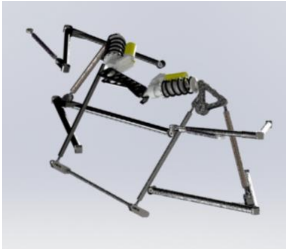
Fig 2: Rear pushrod suspension for Tiger 18

Strain gages were attached to all suspension links on last year's Tiger 17 in a Wheatstone Bridge configuration to measure loads with maximum accuracy. Strain gages specifically on the push- and pullrods were used to measure aerodynamic loads on Tiger 18.