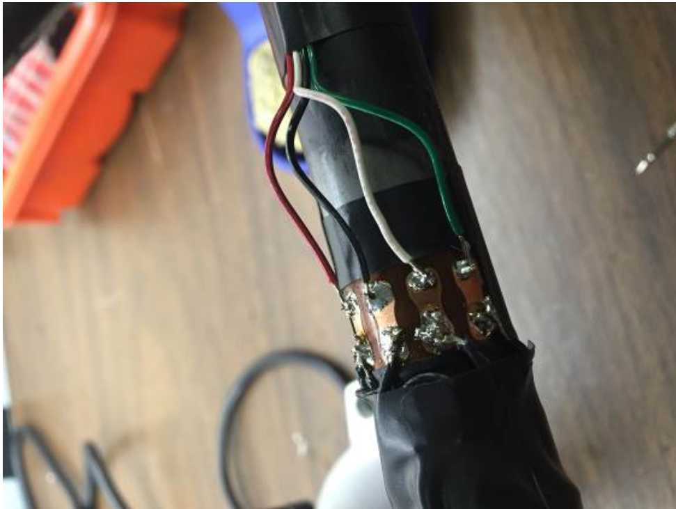
Fig 4: Wiring the connections on the gages to form a Wheatstone Bridge configuration