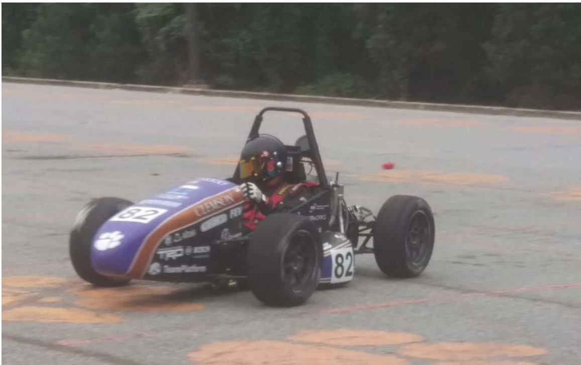
Fig 6: Tiger 17 test run with strain gages installed

Clemson Formula SAE is incredibly grateful for Micro-Measurements' support and technical expertise to aid us in our data acquisition endeavors. The use of strain gages allowed us to reduce maximum unsprung weight, as well as provide us with the information necessary to optimize the Tiger 18 suspension tuning with our new aerodynamic package. The result was a lighter car that could accelerate quicker, respond to inputs quicker, and corner at higher speeds. This was instrumental in helping us improve our results from 84 th place overall in 2015 to 51 st in 2016. This is only the beginning, as this information will continue to help us. Next year the full aero package will include a front and rear wing, and we are planning to switch to carbon fiber for suspension components.