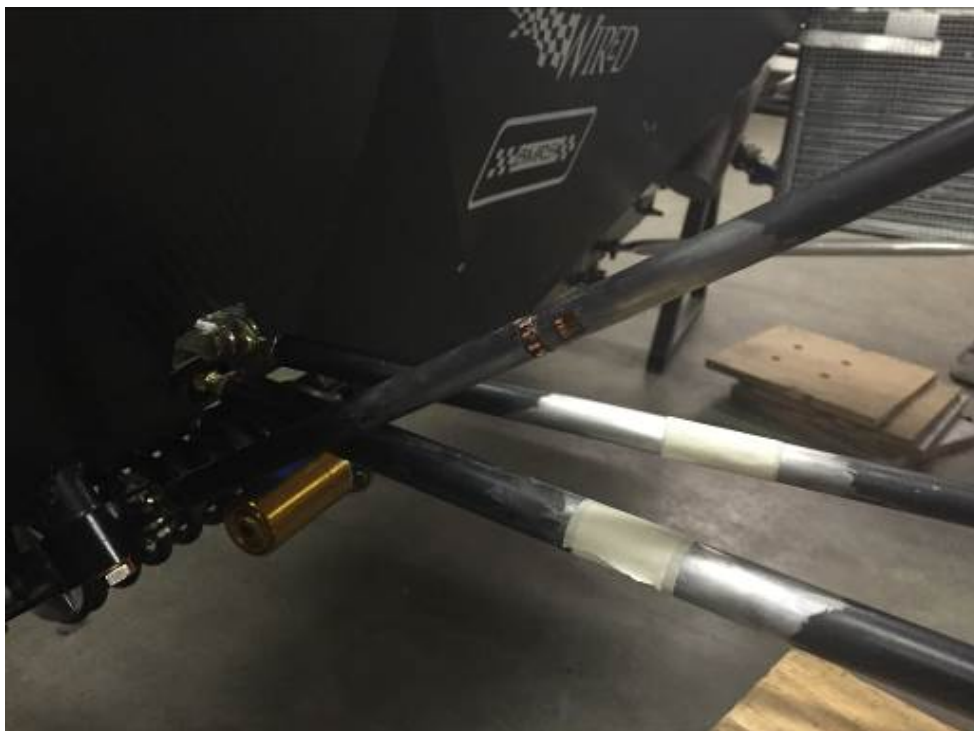
Fig 5: Gages as seen when installed on the car