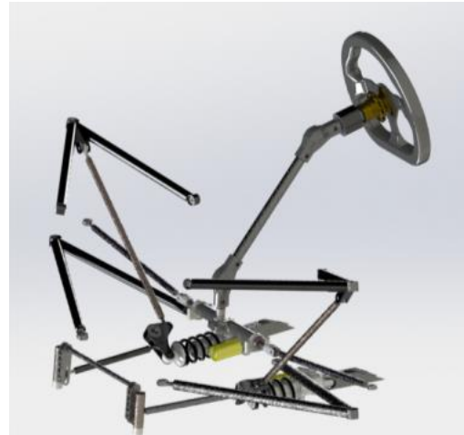
Fig 3: Front pullrod suspension for Tiger 18