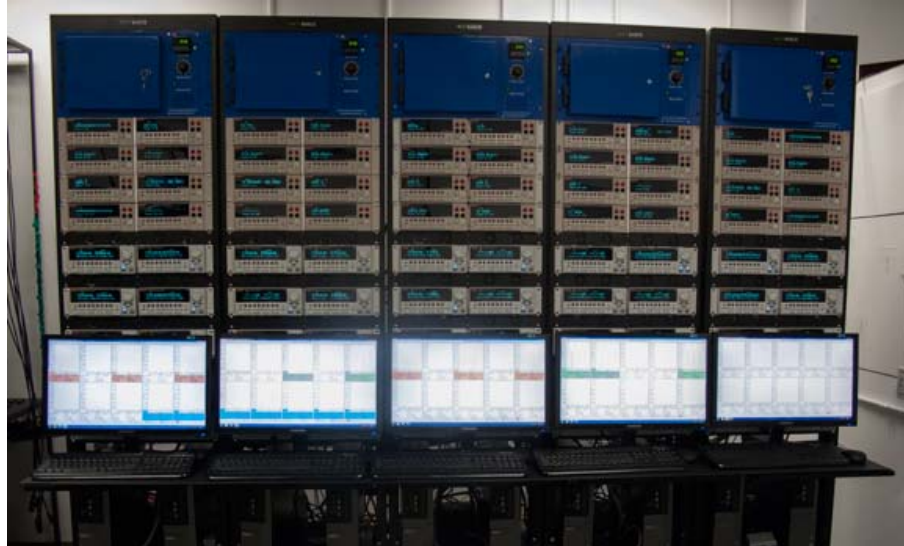
Figure 3: The Dalhousie UHPC