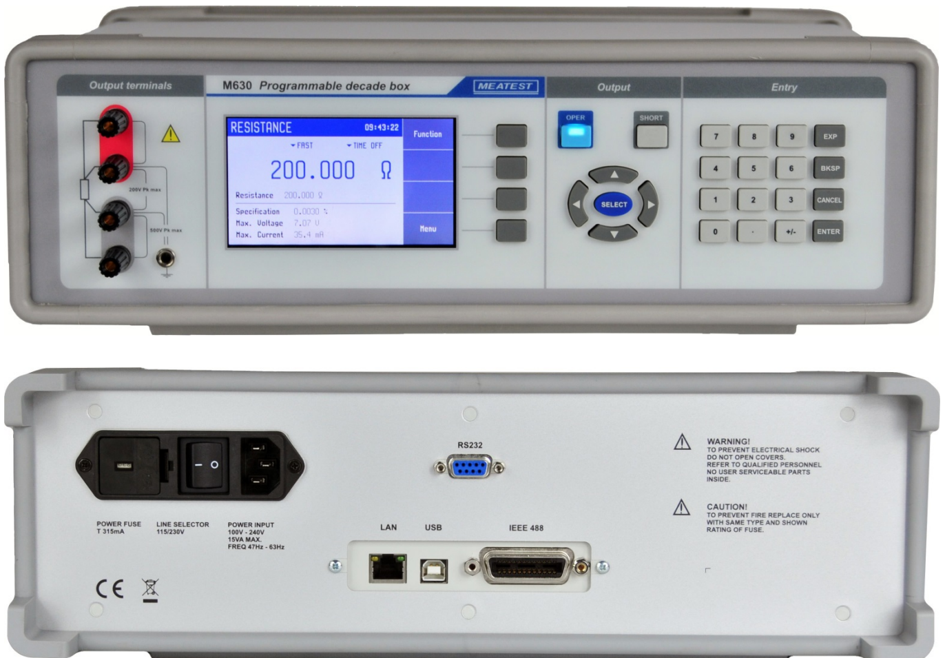
Figure 2: MEATEST's M630 programmable decade box (front and rear view) for RTD temperature simulation and industrial testing

“We have achieved excellent results using Vishay Foil Resistors components for precision measurement in the past, so we didn't consider any other manufacturer for our decade box.”