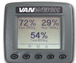
Each Axle Displayed as a Percentage

Airedale House | Canal Road | Bradford BD2 1AG Ph: +44 (0)1274 771177 | Fax: +44 (0)1274 781178 E-mail: obw.eur@vpgsensors.com