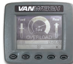
Gross Overload Warning