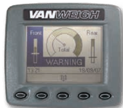
Front Overload Warning