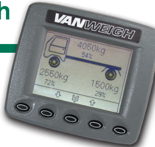
VanWeigh Digital Indicator