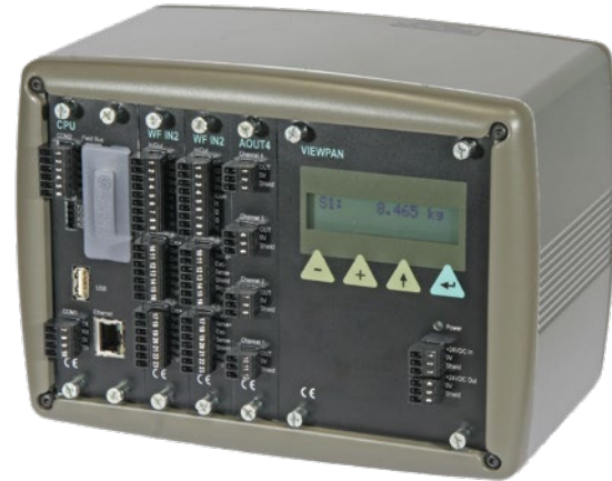
DIN-Rail Mount Unit

G4-RM instruments accommodate up to three different, easily installed, modules for advanced performance, more functional channels, custom applications, or repair. This provides customers with a highly flexible, upgradeable, single instrument system capable of weighing up to six independent vessels or scales. For web tension applications, up to six zones (rolls) can be monitored simultaneously. Inputs and outputs can be configured according to customer requirements.