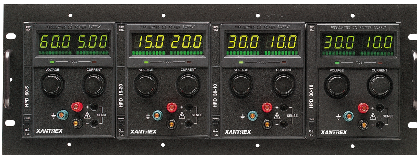
Four Units Rack Mounted