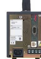
Optional RS-232 Interface Card