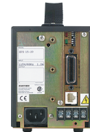
Optional GPIB Interface Card