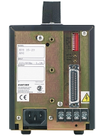
Optional APG Interface Card