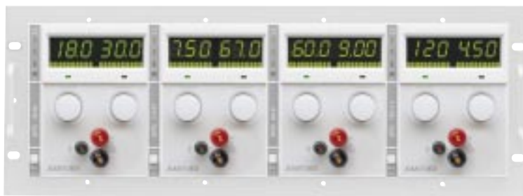
Four units rack mounted