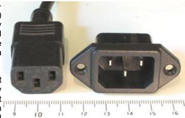
The modern standard: IEC C13 cord outlet and C14 chassis inlet.

Most of these old types are obsolete and not often encountered. This article serves primarily to document the '163' type which was prevalent enough and used on enough equipment of high calibre (esp. HP) that there is still some demand for missing cordsets. A few other types are thrown in as examples of the earlier diversity.