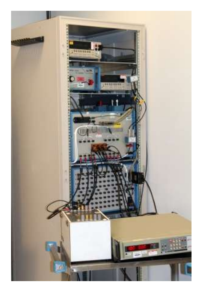
Figure 6. This rack contains resistance bridges to transfer resistance values from reference resistors to the working resistors shown in Figure 3.

For resistances from 10 M \Omega to 10 T \Omega , Keithley uses what it calls an HRTS (High-Resistance Transfer System). This system consists of an accurate decade divider, voltage source and an electrometer that acts as a null detector. As in the case above, this forms a ratiometric bridge to enable the transfer of decade values from the NIST reference standard to higher value resistances of transfer standards.