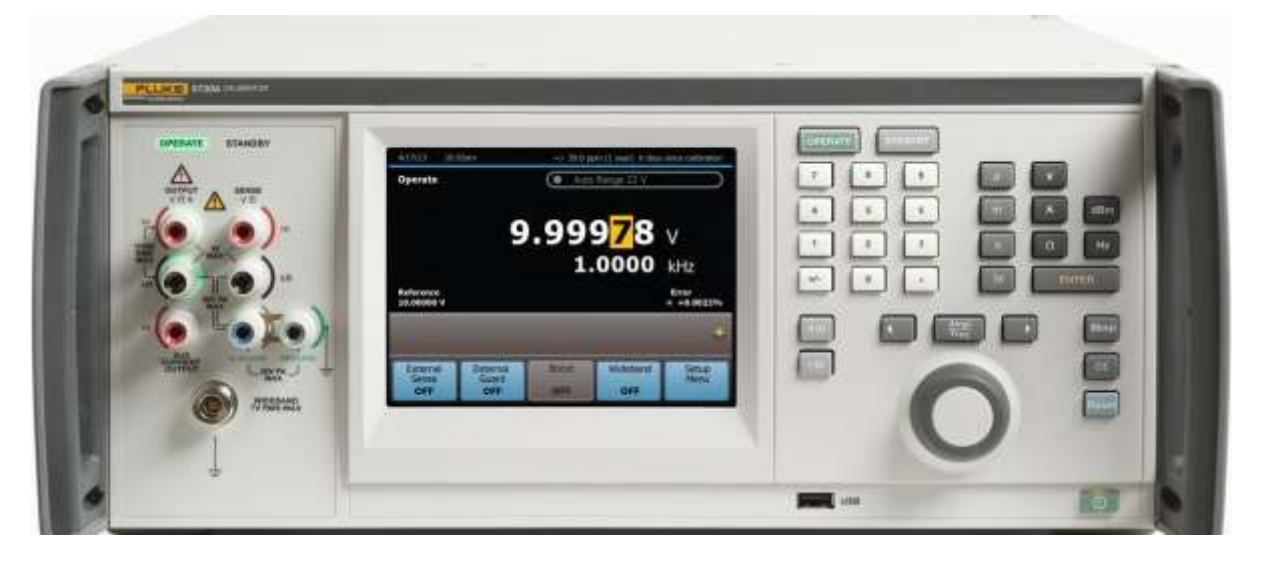
Figure 2. Keithley uses a Fluke 5730A Multifunction calibrator to calibrate multimeters .

Keithley uses Fluke <u>5720A</u> and <u>5730A</u> multifunction calibrators as the main sources to calibrate multimeters. The calibrator produces voltage, current, and frequency, in addition to resistance. Many calibration labs in the industry and at independent labs use these calibrators to calibrate the instruments you use in your lab or production line.