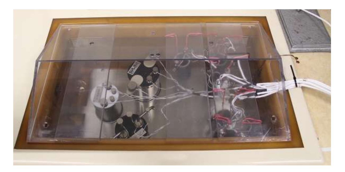
Figure 7. At the top of the resistance chain, Fluke reference resistors reside in oil baths for temperature stability.