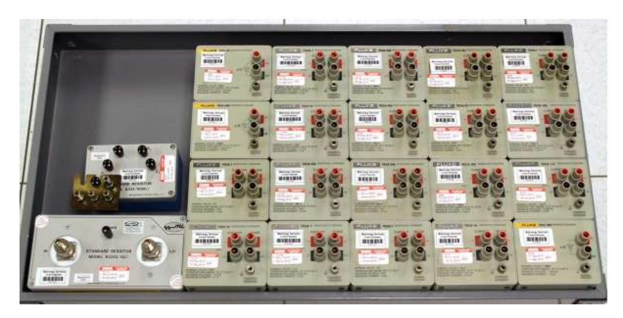
Figure 3. Fluke 742A resistance standards are used to check multifunction calibrators for resistance.

To calibrate a multifunction calibrator with a resistance standard, you need a transfer standard because the calibrator and resistors are both sources. Thus, measurements of both are needed. Keithley uses a Fluke 8508A DMM ( Figure 4 ) to measure and compare the multifunction calibrators' resistance outputs against the working resistance standards. The 8508A has two sets of four-wire resistance inputs and a compare mode. "The Fluke 8508A is used in ratio mode to measure the resistance outputs of the multifunction calibrators by comparing resistance outputs to the working resistance standards," said Travise. "The 8508A returns the ratio of UUT-to-standard resistor ( R_{UUT}/R_{STD} ). The predicted value of the standard resistor is multiplied by the reported ratio, yielding the value of R_{UUT} ."