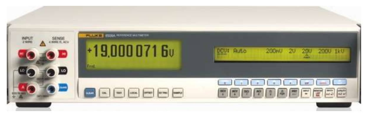
Figure 4. A Fluke 8508A DMM measures the outputs of the working resistance standards for transferring to the multifunction calibrator.

To calibrate a multifunction calibrator with a resistance standard, you need a transfer standard because the calibrator and resistors are both sources. Thus, measurements of both are needed. Keithley uses a Fluke 8508A DMM ( Figure 4 ) to measure and compare the multifunction calibrators' resistance outputs against the working resistance standards. The 8508A has two sets of four-wire resistance inputs and a compare mode. "The Fluke 8508A is used in ratio mode to measure the resistance outputs of the multifunction calibrators by comparing resistance outputs to the working resistance standards," said Travise. "The 8508A returns the ratio of UUT-to-standard resistor ( R_{UUT}/R_{STD} ). The predicted value of the standard resistor is multiplied by the reported ratio, yielding the value of R_{UUT} ."