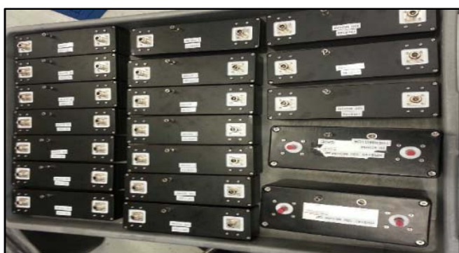
Fig. 2. Final Resistor assembly. 100 MΩ, 1 GΩ, 10 GΩ, and 100 GΩ resistors shown.

Each hermetically sealed resistance element was packaged in an aluminum enclosure with coaxial connectors as shown in Figure 2. Each terminal of the resistor element was soldered to the inner terminal of an N-type female connector (Glass dielectric type, 50 Ohm Impedance). The outer terminal of each N type connector was soldered to the hermetically sealed container. The N-type connector is mounted on a rectangular PTFE plate on the top panel of an aluminum box, which isolates the N-type connectors from the aluminum box. Each hermetically sealed container uses a support made of visco-elastic material to provide vibration and electrical isolation of the hermetically sealed container from the aluminum box.