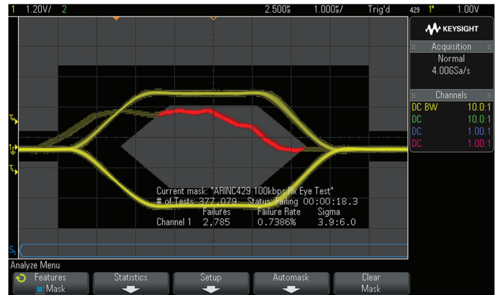
Figure 3. Pass/fail masks based on industry specifications can be created on a PC and then downloaded to the scope.

Another method is to import a multi-region mask that has been previously created on a PC based on published standards. Figure 3 shows an example of an eye-diagram test based on an imported mask of an ARINC 429 serial bus signal which is common in the aerospace/defense industry. In this example we see that a significant number of pulses are failing the test.