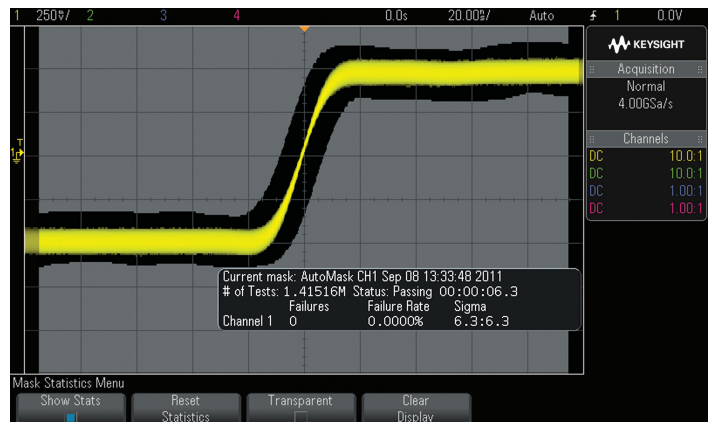
Figure 1. Mask testing can test multiple wave shape parameters at once including maximum allowable noise.

Another method of automated waveform testing is pass/fail mask testing as shown in Figure 1. With built-in oscilloscope mask testing, pass/fail limit bands are either established within or transferred to the scope. Captured waveforms are then quickly compared against the limit bands (the mask). One advantage of mask testing is that multiple characteristics of captured waveforms can be tested using a single mask. Rather than testing against a specific parameter, such as a peak-to-peak voltage, mask testing will test the overall shape of a waveform that may include V_{pp} , rise time, pulse width characteristics, as well as maximum allowable noise.