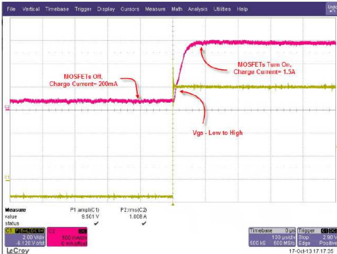
Figure 3. Charge Current Transition With MOSFET Turn On

The Vgs supply is derived from the high current source (wall adapter); when this supply is available, charge current can be increased.