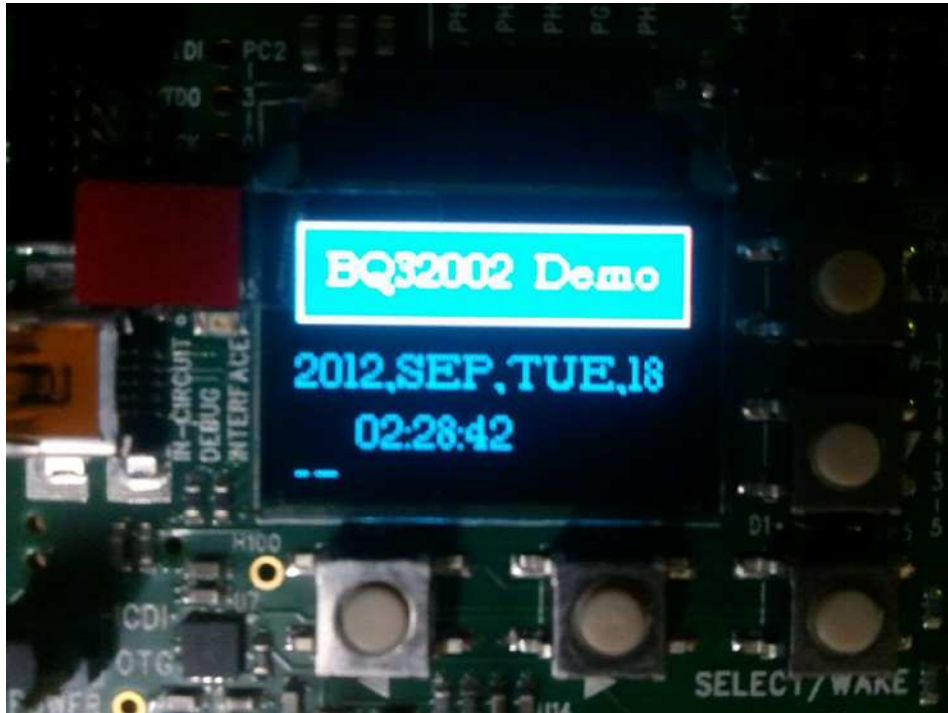
Figure 2. Time Display Format

Once the I2C operation is completed, all the time keeping register data from BQ32002 is loaded to an array named as timearr[ ] . After the above function call, the array timearr[ ] will have all the values from 7 internal registers of BQ32002, which are Seconds, Minutes, Hours, Day of week, Date, Month and Year registers. After retrieving the values from BQ32002, the application updates the values in to the display as shown in Figure 2 using the displayfulldate() function.