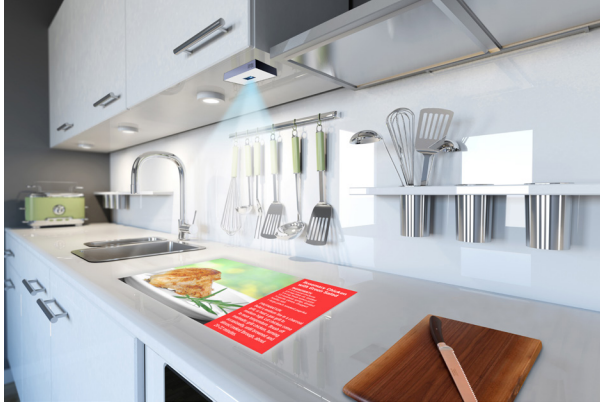
Figure 4. New ways to showcase a cooking video.

of 4K UHD solutions in the industry shown below in Figure 5 . Each chipset has been optimized to meet the requirements of a particular segment of applications. The chipsets range from one optimized on size and power savings for portable applications; another is also small enough for portable systems but it provides even higher levels of brightness; and a third chipset generates the brightness needed in some of the most demanding projection applications.