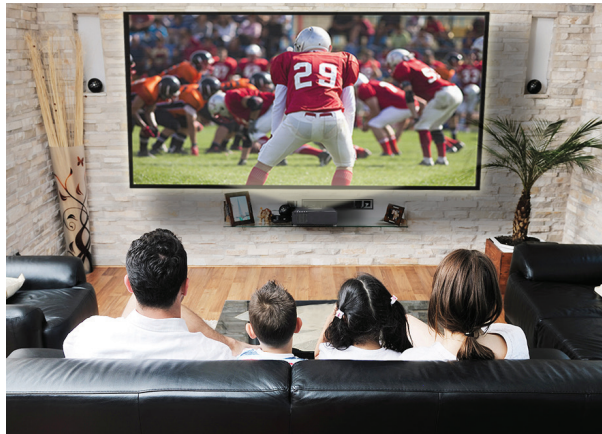
Figure 2. Laser TVs with ambient light rejection screens

Like mobile smart TVs, DLP technology-based laser TVs can deliver on-demand streaming content, but rather than LEDs, they use lasers as the illumination source. This allows the product to achieve higher levels of brightness, up to 5,000 lumens. Laser illumination enables large, bright displays even in a well-lit room. Laser TVs can also feature ultra-short throw optics, which means they can be placed just inches away from the wall, taking up very little space in the room. In addition, some laser TVs are bundled with an ambient light rejection screen which enhances the projected image and creates a glowing effect as seen in Figure 2 .