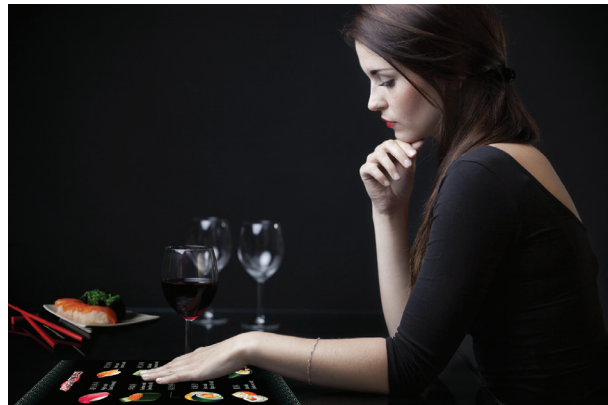
Figure 3. Interactive displays engage restaurant visitors.

display surfaces. The front window of a store in a shopping mall might become one massive video display without obscuring the view into the store in the background. Digital 4K UHD projection signage can range from real-time informative to the totally immersive, drawing viewers into the scene on display.