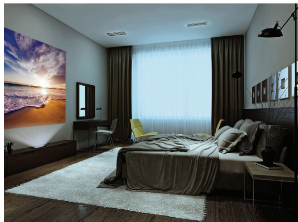
Figure 1. Mobile Smart TVs can be utilized in a variety of settings.

With short-throw optics, mobile smart TVs can be placed on a wide range of surfaces and cast a 4K UHD image on a wall or screen only inches away. As seen in Figure 1 , for apartment dwellers, individuals who like displays in their bedrooms or students in dormitories who don't really have the room for bulky flat panel screens, a mobile smart TV can be kept in a drawer or some other out-of-the-way place until needed. And for consumers who move often, a mobile smart TV is much easier than flat panel displays to pack and transport.