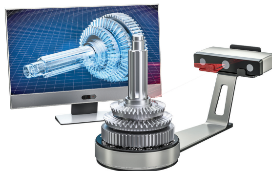
Figure 2. Optical 3D scanning with structured light

surface and combines the positional data from each point to create a 3D surface model ( Figure 1 ). Optical methods such as structured light ( Figure 2 ) later emerged for 3D scanning. Structured light is the process of projecting a series of patterns onto an object and capturing the pattern distortion with a camera or sensor. A triangulation algorithm then calculates the data and outputs a 3D point cloud, which becomes the data for various calculations in measurement, inspection, detection, modeling or machine vision systems. Optical 3D scanning is popular because it does not touch the object being measured and can be acquired very quickly, or even in real time.