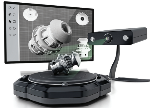
Figure 7. Desktop prosumer 3D scanner

complete details of real-world objects in a 3D data format ( Figure 7 ). The data can then be used for product design, part engineering, 3D content creation, or as input to a 3D printer. For example, online retailers can 3D scan their products and present them online in a true, high-quality 3D model instead of 2D pictures. Gamers may 3D scan themselves and create their own avatars in a game.