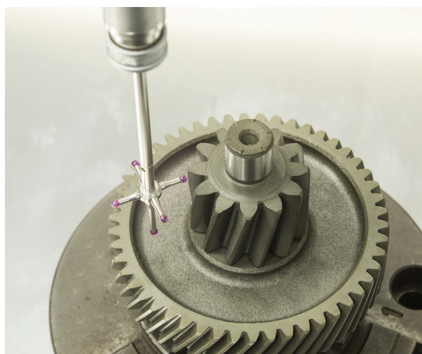
Figure 1. Example of a coordinate measurement machine probe

Coordinate measurement machines (CMMs) were one of the first industrial solutions to gather 3D information. A probe physically touches an object’s