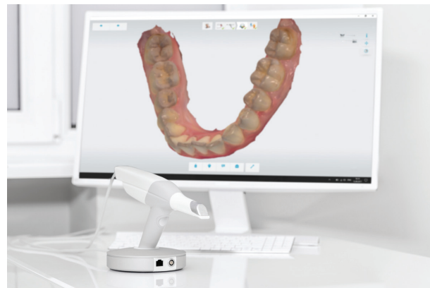
Figure 4. Dental intra-oral scanner

There has been explosive growth using 3D scanning technologies in the medical industry. Intra-oral scanners (IOS), for example capture direct optical impressions in dentistry ( Figure 4 ). Micron-level 3D image accuracy is required to fabricate prosthetic restorations such as inlays, onlays, copings, and crowns. IOSs simplify clinical procedures for dentists, eliminate the need for plaster models and reduce patient discomfort.