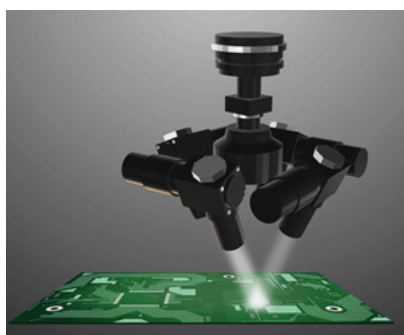
Figure 3. Illustration of PCB 3D SPI

3D automated optical inspection (AOI) is a powerful technique used in manufacturing settings to provide real-time, in-line, decisive measurements relating to part quality. For example, 3D measurements for PCB solder paste inspection (SPI) are highly preferred since they measure the actual volume of solder paste deposited before component placement, helping prevent poor-quality solder joints ( Figure 3 ). PCB manufacturing also leverages 3D AOI in-line after component placement, reflow, final inspection, and rework operations to maximize quality and reliability. As 3D inspection capabilities become more widespread, there are several