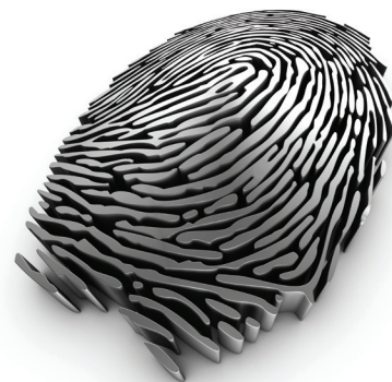
Figure 8. Fingerprint rendering resulting from a 3D scan

The use of biometric identification and authentication continues to increase. It is often used for securely locking or unlocking devices, security checks, and financial transactions. Using optical 3D scanning technology to capture face, fingerprint or iris biometrics can be a more secure means of identification and makes hacking and other attacks more difficult ( Figure 8 ).