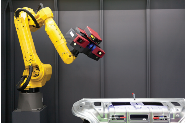
Figure 5. Robotic arm with 3D scanner

and accurately measure x, y, and z dimensions for improved quality assurance. Inline 3D vision systems combined with robot arms have also emerged in the market ( Figure 5 ). These robotic implementations can greatly increase speed and quality at automotive ( Figure 6 ) and other production-line factories. Adding 3D inspection at specific stages of the assembly and production process can catch quality issues early, thereby reducing waste and rework. 3D scanning systems can even be implemented inside computer numerical controlled (CNC) equipment and 3D printers to enable real-time measurements during the manufacturing process.