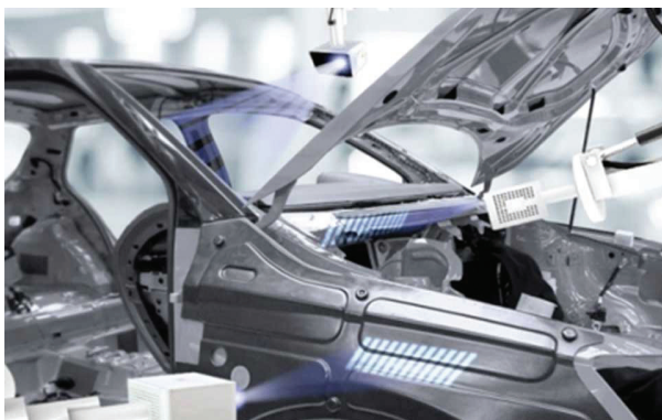
Figure 6. 3D structured light scanning for automotive alignment and inspection

and accurately measure x, y, and z dimensions for improved quality assurance. Inline 3D vision systems combined with robot arms have also emerged in the market ( Figure 5 ). These robotic implementations can greatly increase speed and quality at automotive ( Figure 6 ) and other production-line factories. Adding 3D inspection at specific stages of the assembly and production process can catch quality issues early, thereby reducing waste and rework. 3D scanning systems can even be implemented inside computer numerical controlled (CNC) equipment and 3D printers to enable real-time measurements during the manufacturing process.